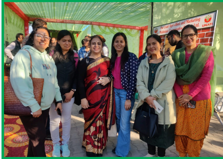
Participated in Stakeholder Consultation at Unati, Talwara by PSCST on 23rd Feb 2024