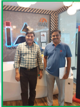
Visit to Munjal BCU Centre of Innovation & Entrepreneurship on 31st May 2024