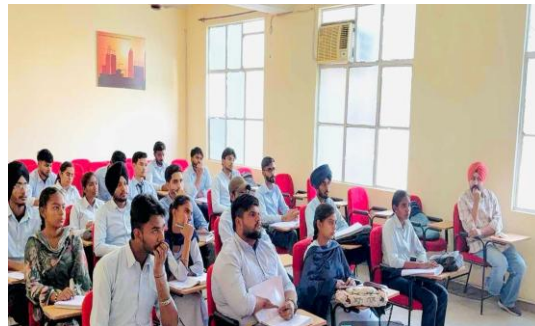
Glimpses of Webinar on Introduction to Mv DAD Cloud-Based RC Building Earthquake-Resistant Structural Design Software