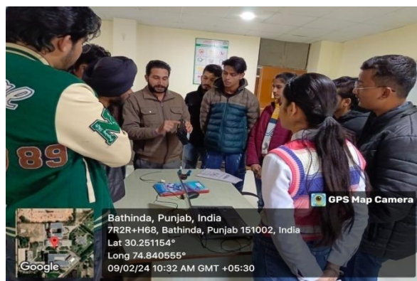
Hands on Training