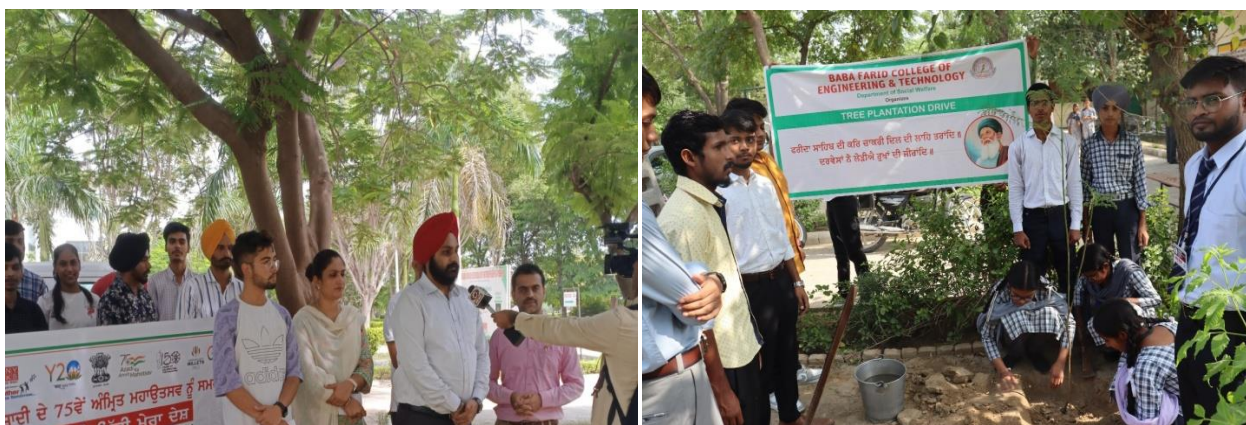
Glimpses of Tree Plantation at village Buladewala

Baba Farid college of engineering and technology took a significant step towards environmental conservation by organizing a Tree Plantation Drive on August 09, 2023, as part of the "Meri Matti Mera Desh" campaign. The drive aimed to contribute to a greener future by planting saplings in the village Deon, and its nearby areas. The Social welfare Department of Baba Farid College of Engineering and Technology organized a Tree Plantation Activity “Planting for a