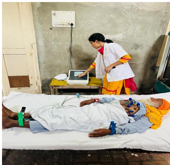
Glimpses of Health Checkup Camp at village Bhokhra

The Social Welfare Department of Baba Farid College of Engineering and Technology has organized “The Health Checkup camp” in Collaboration with “Delhi Heart Hospital” Bathinda at Bhokhra Village on October 08 2023.