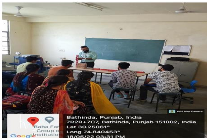
Demonstration of Project