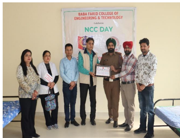
Glimpses of Blood Donation Camp

The Blood Donor Squad exemplifies the institute's commitment to life-saving initiatives. Maintaining a database of blood groups, the squad collaborates with hospitals and NGOs within a 100 km radius. During the COVID-19 pandemic, the squad played a crucial role in arranging blood/plasma donations and organizing vaccination camps. Regular blood donation drives are conducted in partnership with the Indian Red Cross Society to encourage community involvement. A Blood donation camp was organized by the NCC unit of Baba Farid College of Engineering & Technology on November 23 2023 at Baba Farid College of Engineering and Technology, Bathinda in collaboration with the Red Cross Society and Blood Bank of Civil Hospital of Bathinda to celebrate NCC Day.