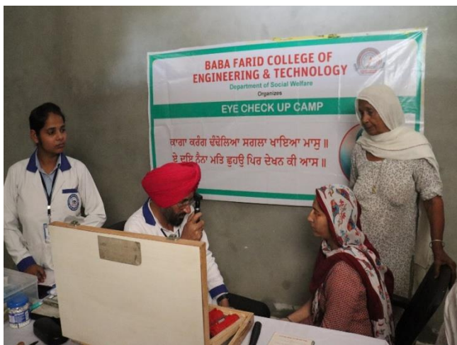
Glimpses of Eye Checkup Camp at village Buladewala

Social Welfare Department of Baba Farid College of Engineering & Technology organized an Eye checkup and health awareness camp in collaboration with Brar Eye Hospital, Bathinda at Buladewala Village on dated October 10 2023 During this visit villagers were made aware about various eye problem faced by people due to excess use of mobile phone along with an eye checkup camp.