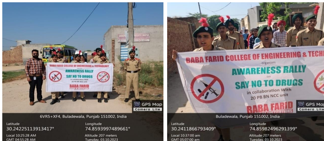
Glimpses of Anti Drug Awareness Campaign Village Bhuladewala

Greener Tomorrow” on September 15, 2023, at Village Buladewala, District Bathinda, under the Green India scheme in collaboration with Gram Panchayat of Village.