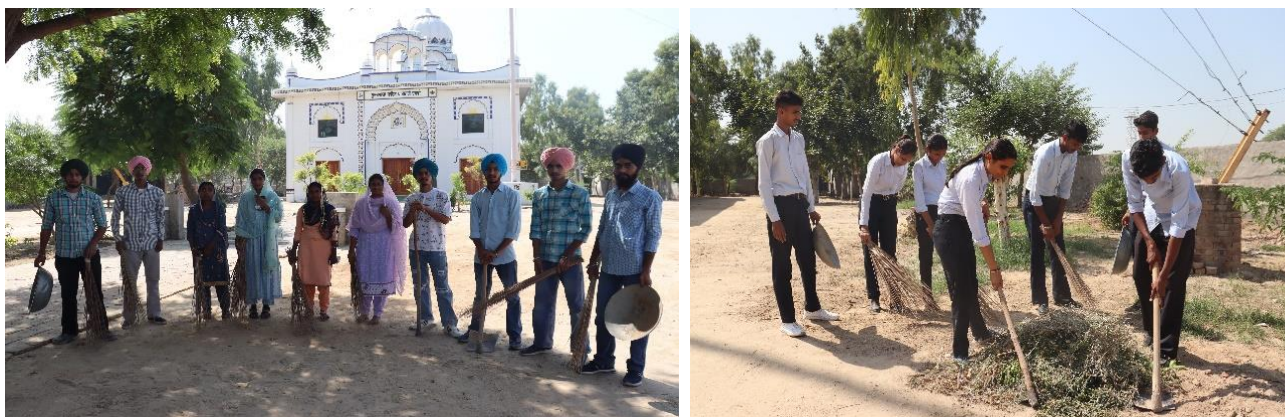
Glimpses of Cleanliness Drive at village Bhokhra

On October 03, 2023, the NSS/NCC Unit of Baba Farid College of Engineering and Technology, Bathinda, organized a rally in Village Bhuladewala, District Bathinda, Punjab, as part of the Nasha Mukh Bharat Abhiyan program. The primary aim of the rally was to raise awareness against drug abuse.