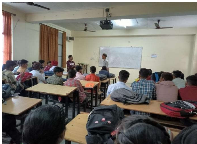
Public Speaking Session on November 27,2021.