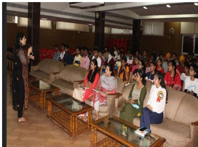
Personality development session held on December 22, 2021