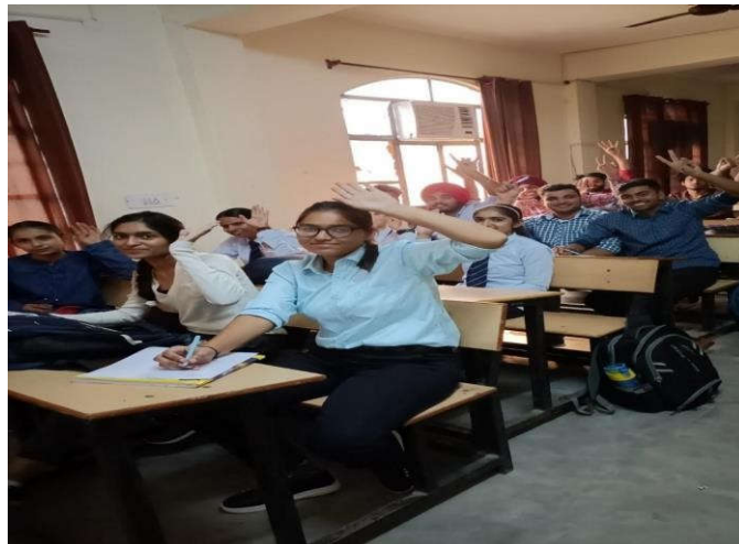
Interactive Session with students on October 25,2021.