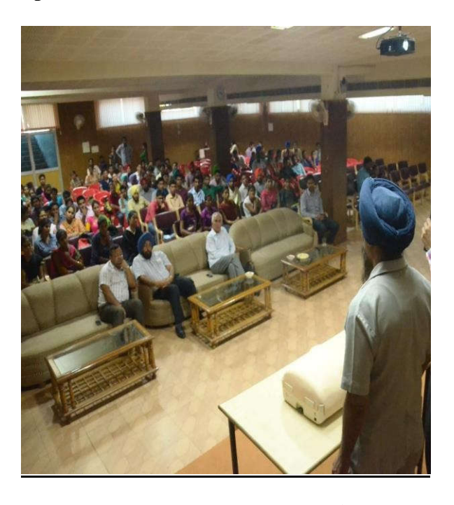
First Aid Awareness Workshop held on 18th October, 2018