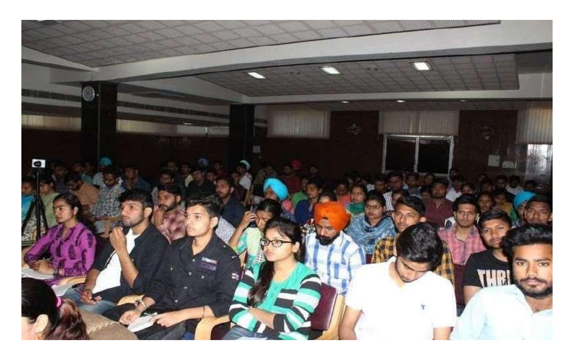
Glimpse of Entrepreneurship awareness camp on 12-14 March 2018