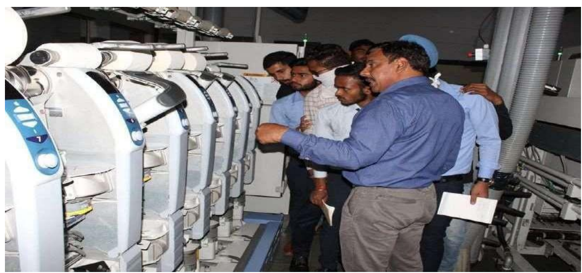
Visit to Sportking Industries